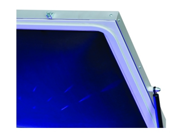
Perfect contact between screen and vacuum rubber due special rubber