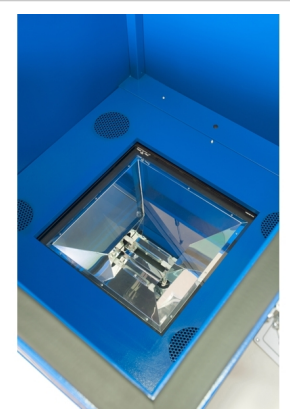
Units equipped with metal haladite lamps available