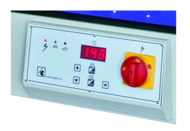
LCD control Panel with fully automatic operation for vacuum and exposure