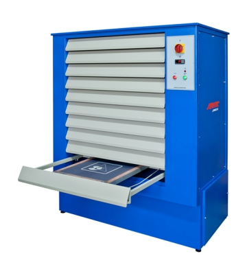
Drying cabinets with several sizes available