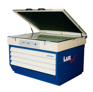
Exposure units equipped with drying cabinets available

The LUX MIDI LED is a machine suitable to expose screen printing screen. The machine is equipped with special UV SPECIAL LEDS for faster screen exposure and maximum detail. The LUX MIDI LED is fully automatic and is equipped with a pressure meter for the vacuum to prevent accidental opening from screens.