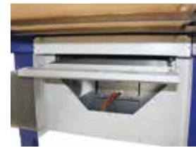
Fast and easy replaceable air filter