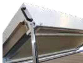
Simple hood opening by gas spring